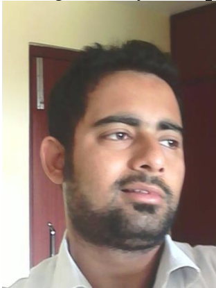
Facing Sideways X