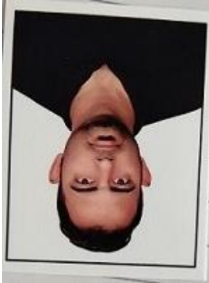
Inverse Photo X