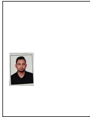
Too Small X