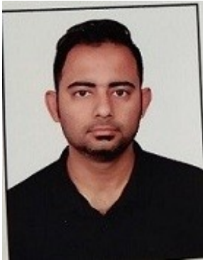
Too much Extra Color X